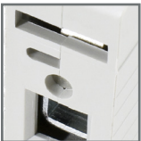
capability to connect using comb busbars