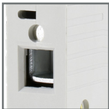
terminal capacity: max. 25 mm 2