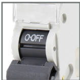
possibility of sealing