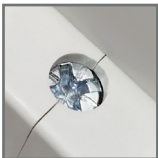
galvanised steel terminals